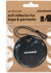
HANGING REFLECTOR CIRCLE BLACK, ART. NO. 422