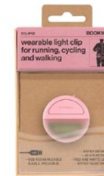
ECLIPSE PINK ART. NO. 406