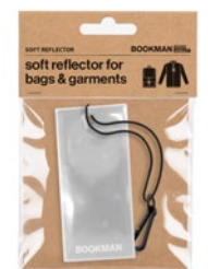
HANGING REFLECTOR RECTANGLE WHITE, ART. NO. 419