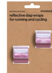
SNAP BAND REFLECTORS PINK, ART. NO. 428