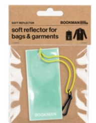
HANGING REFLECTOR RECTANGLE MINT, ART. NO. 421