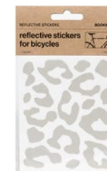
REFLECTIVE LEOPARD PRINT STICKERS WHITE, ART. NO. 349