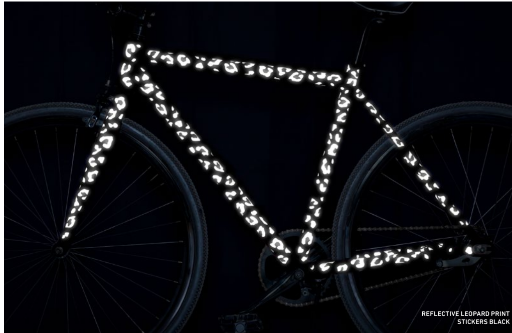
REFLECTIVE LEOPARD PRINT STICKERS BLACK