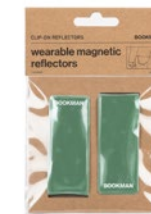
CLIP-ON REFLECTORS GREEN, ART. NO. 437