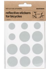
REFLECTIVE STICKERS WHITE, ART. NO. 273