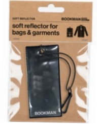
HANGING REFLECTOR RECTANGLE BLACK, ART. NO. 418