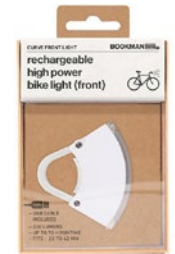
CURVE FRONT LIGHT WHITE/WHITE, ART. NO. 446