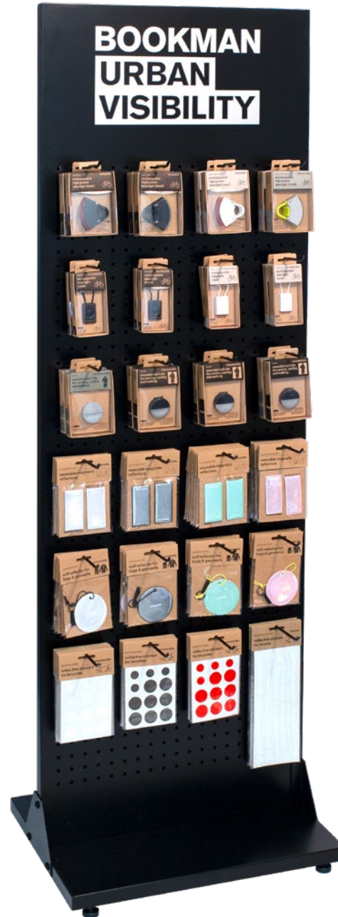
FLOOR DISPLAY LARGE ART. NO. 436