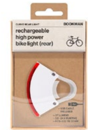
CURVE REAR LIGHT WHITE/WHITE, ART. NO. 410