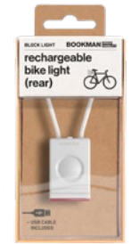
BLOCK LIGHT REAR WHITE, ART. NO. 414