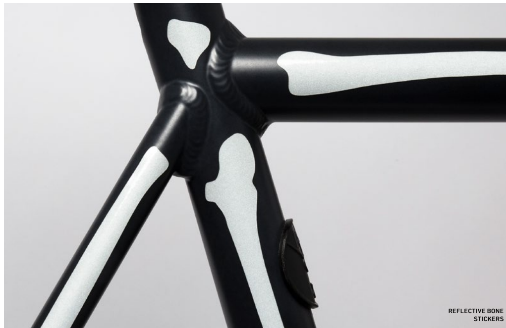
REFLECTIVE BONE STICKERS