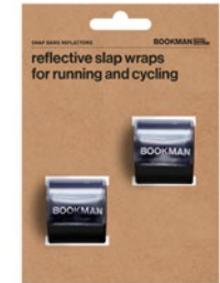
SNAP BAND REFLECTORS BLACK, ART. NO. 426