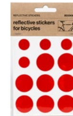
REFLECTIVE STICKERS RED, ART. NO. 272