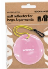
HANGING REFLECTOR CIRCLE PINK, ART. NO. 424