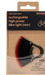
CURVE REAR LIGHT BLACK/BLACK, ART. NO. 370