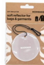
HANGING REFLECTOR CIRCLE WHITE, ART. NO. 423