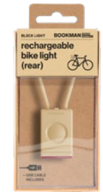
BLOCK LIGHT REAR BEIGE, ART. NO. 448