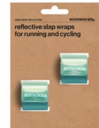
SNAP BAND REFLECTORS MINT, ART. NO. 429