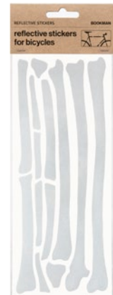
REFLECTIVE BONE STICKERS, ART. NO. 379