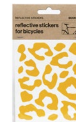
REFLECTIVE LEOPARD PRINT STICKERS YELLOW, ART. NO. 348