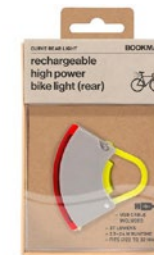
CURVE REAR LIGHT GRAY/ACID YELLOW, ART. NO. 371