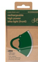
CURVE FRONT LIGHT GREEN, ART. NO. 439