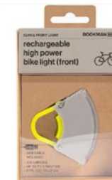
CURVE FRONT LIGHT GRAY/ACID YELLOW, ART. NO. 416