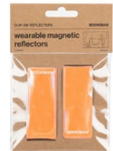
CLIP-ON REFLECTORS ORANGE, ART. NO. 438