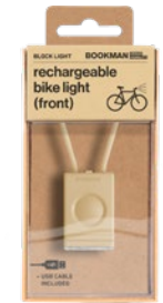
BLOCK LIGHT FRONT BEIGE, ART. NO. 446