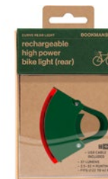
CURVE REAR LIGHT GREEN, ART. NO. 441