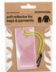
HANGING REFLECTOR RECTANGLE PINK, ART. NO. 420