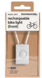
BLOCK LIGHT FRONT WHITE, ART. NO. 412