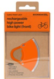
CURVE FRONT LIGHT ORANGE, ART. NO. 440