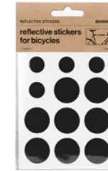
REFLECTIVE STICKERS BLACK, ART. NO. 317