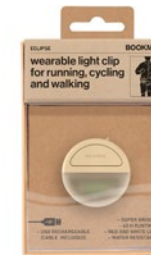
ECLIPSE BEIGE ART. NO. 444