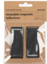
CLIP-ON REFLECTORS BLACK, ART. NO. 296