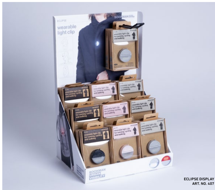
ECLIPSE DISPLAY ART. NO. 407