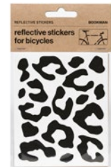
REFLECTIVE LEOPARD PRINT STICKERS BLACK, ART. NO. 347