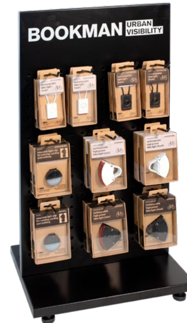
TABLETOP DISPLAY MEDIUM ART. NO. 435