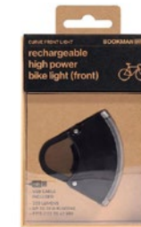
CURVE FRONT LIGHT BLACK/BLACK, ART. NO. 445

Package contents — Curve Front Light — Micro USB cable