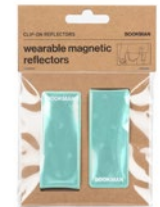
CLIP-ON REFLECTORS MINT, ART. NO. 409