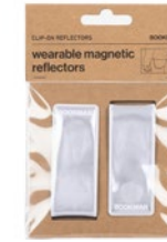
CLIP-ON REFLECTORS WHITE, ART. NO. 279