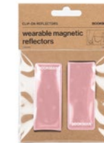
CLIP-ON REFLECTORS PINK, ART. NO. 408