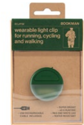
ECLIPSE GREEN ART. NO. 443