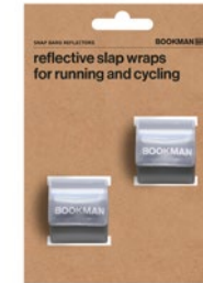
SNAP BAND REFLECTORS WHITE, ART. NO. 427