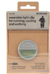
ECLIPSE GRAY ART. NO. 405