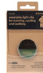
ECLIPSE BLACK ART. NO. 404