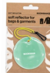
HANGING REFLECTOR CIRCLE GREEN, ART. NO. 425