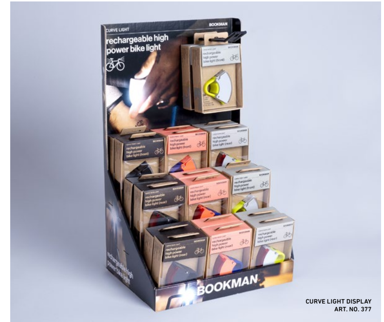
CURVE LIGHT DISPLAY ART. NO. 377