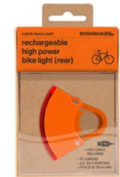
CURVE REAR LIGHT ORANGE, ART. NO. 442