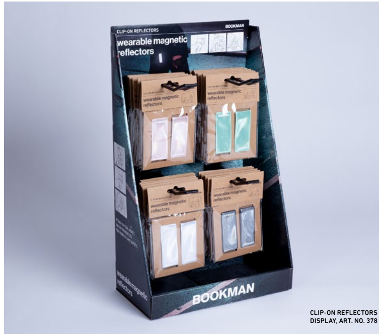
CLIP-ON REFLECTORS DISPLAY, ART. NO. 378